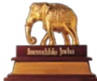
Best Conference Agency

7 National Tourism Award by Government of India, Dept. of Tourism 1995 - 1996, 1998 - 1999, 1999 - 2000, 2001 - 2002, 2002 - 2003, 2003 - 2004, 2004 - 2005