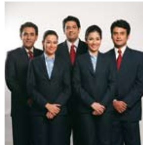
Professional Tour Managers