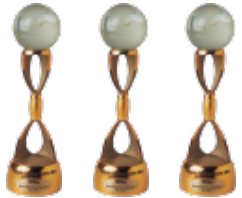
Best Foreign Tour Operator

South East Asia by Malaysia Tourism 2000 - 2001, 2001 - 2002, 2002 - 2003