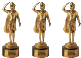
Best Domestic Tour Operator

by Galileo Express Travel & Indian Express 2003 - 2004, 2004 - 2005, 2005 - 2006