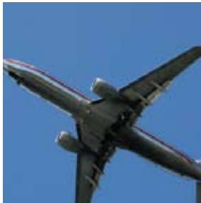
Confirmed Airline Seats

Product Superiority / Fly the best of airlines / Stay at the finest of hotels / Professional Tour Managers