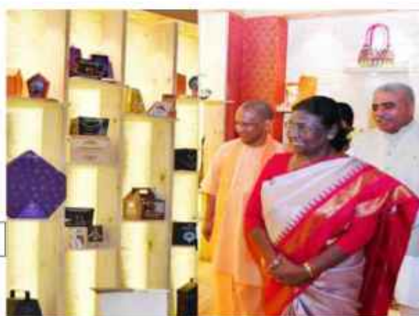
Displayed IIP's activity during International Exhibition (Indus food -2024) and showcased different Food Packaging Design Developed by IIP at IEM, G- Noida (3-10 Jan 2024)