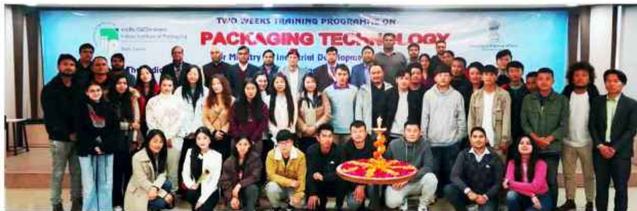
Organized three weeks residential Training programme on Packaging Technology for Ministry of Industrial Development, Bhutan under The Indian Technical & Economic Cooperation ( ITEC ), Ministry of External Affairs ( MEA), GOI at IIP Delhi