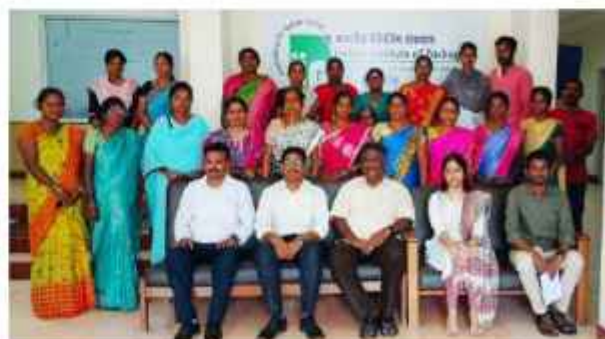
Two Days Training Programme on "Packaging and Branding" for Enterprises of Tamil Nadu Rural Transformation Project ( Vazhndhu Kattuvom Project )