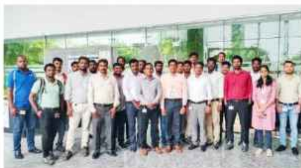
One Day Customized Training Programme on "Sustainability in Packaging" for Daimler India, Chennai. Conducted by IIP Chennai on 15 Nov 2023