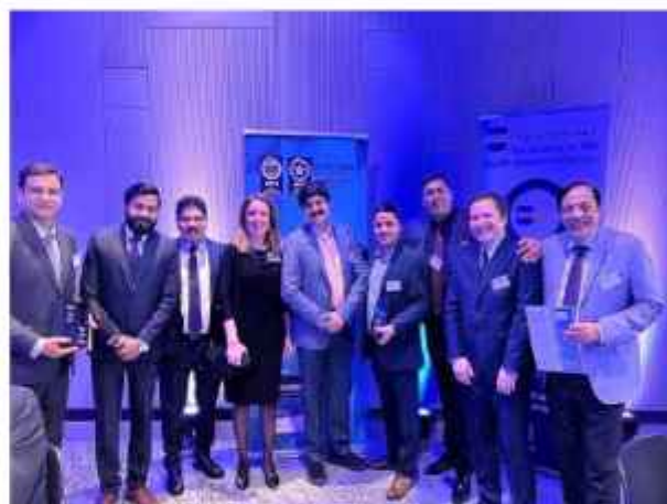
IIP participated International Packaging exhibition 'INTERPACK 2023' held at Düsseldorf, Germany during 04-10 May 2023.