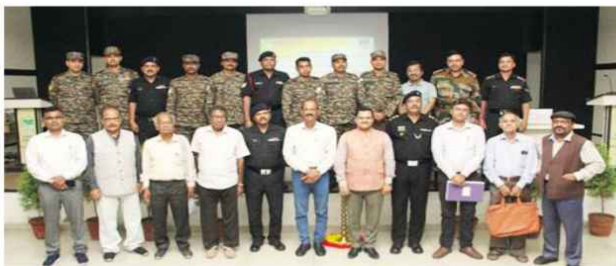
One Day Training Programme on “Packaging of Boka Chawl and Assam Silk” under the PMFME Scheme, Organized by Industries, Commerce and Public Enterprise Department, Government of Assam and Conducted by Indian Institute of Packaging, Kolkata on 25 th August, 2023