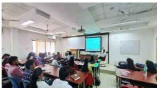
Two Days Training Programme on Corrugated Fibre Board Boxes was conducted during 21st – 22nd March, 2024 at Conference Hall IIP, Hyderabad.