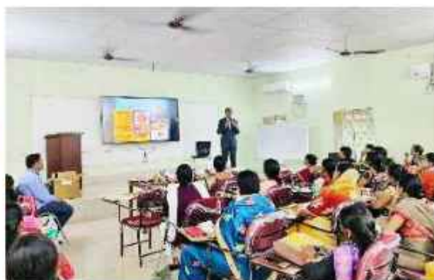
Two days training programme on Packaging of Millet Products at Bolangir, Odisha for Directorate of Agriculture and Food Production, Agriculture and Farmer's Empowerment Department, Govt. of Odisha (DA&FP, OMM) from 5/02/24 to 6/02/24