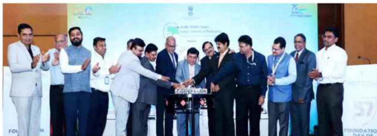
The Indian Institute of Packaging (IIP) celebrated its 57th Foundation Day on May 14, 2023 at Hotel The Lalit, Andheri, Mumbai.