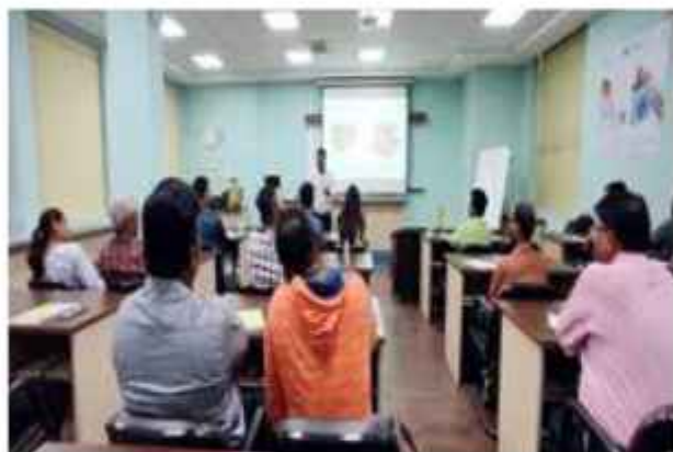
Training Session during One Day Training Programme on "Corrugated Fibre Board Boxes" on 15 th Dec., 2023