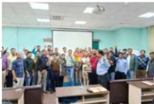
Two Days Hands on Training Programme cum Workshop on Testing & Quality Evaluation of Packaging Materials & Packages on 16 th Feb., 2024