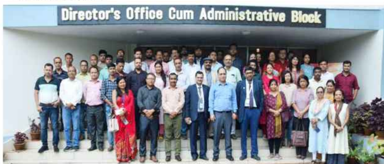
One Day Training Programme on “Packaging of Boka Chawl and Assam Silk” under the PMFME Scheme, Organized by Industries, Commerce and Public Enterprise Department, Government of Assam and Conducted by Indian Institute of Packaging, Kolkata on 25 th August, 2023