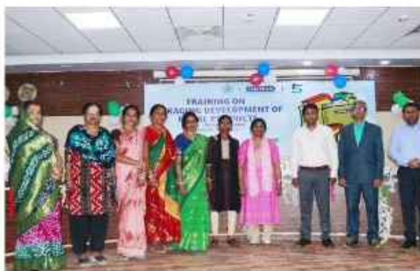
Two days Training Programme on Packaging Development of Rural Products at Baripada for Odisha Rural Development & Marketing Society (ORMAS) from 29/01/24 to 31/01/24