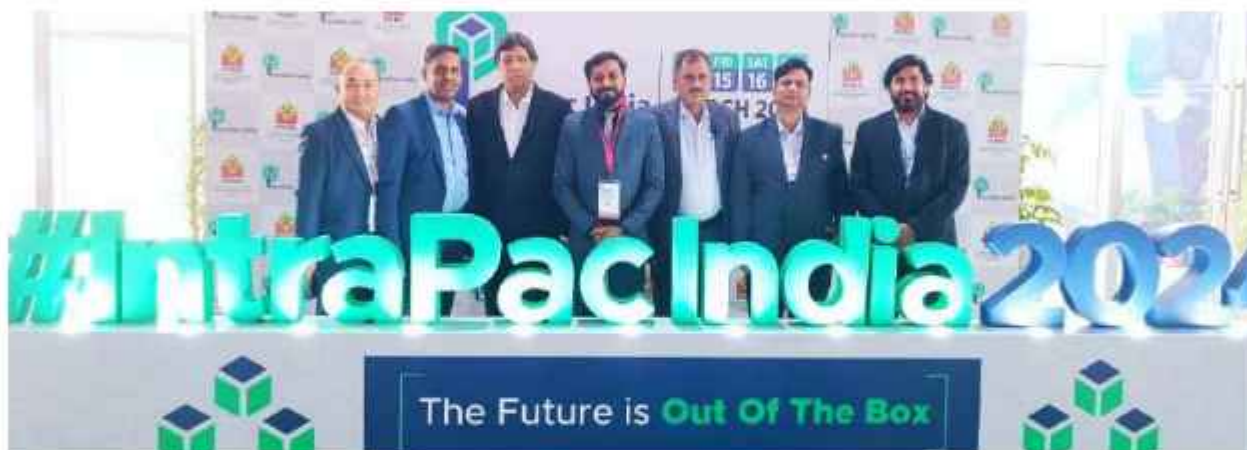
Mumbai DGFT organized outreach cum capacity building programme in association with Thane Small Scale Industries Association (TSSIA) on 29 th December 2023 in Thane. The programme covered various sessions on Foreign Trade Policy, Export promotion, FTP, Payment & Banking, Logistics & E commerce.