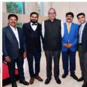
The Indian Institute of Packaging organized the INDIASTAR and PACMACHINE recognition for packaging Excellence on 14 th April, 2023 at NESCO Centre, Goregaon, Mumbai