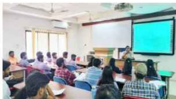
Training Programme on Branding and Marketing Plan for Start-ups