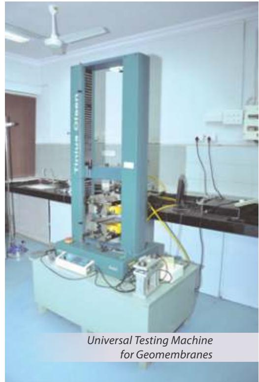
Universal Testing Machine for Geomembranes

Laboratories at the Head Office and regional centres extend testing facilities to the industry for domestic distribution and export, as per National and International Standards like the Bureau of Indian Standards (BIS), International Standards Organisation (ISO), British Standards (BS), American Society for Testing Materials (ASTM) and others. IIP also issues UN Certification for export packages for hazardous goods and equipment calibration standardisation certificates.