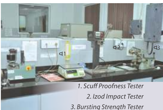
1. Scuff Proofness Tester 2. Izod Impact Tester 3. Bursting Strength Tester