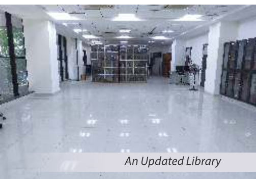
An Updated Library