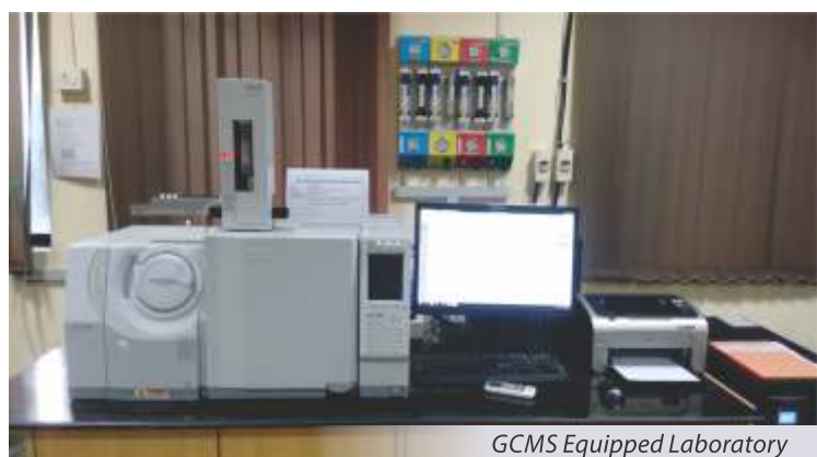
GCMS Equipped Laboratory