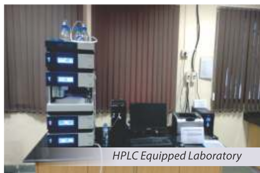
HPLC Equipped Laboratory