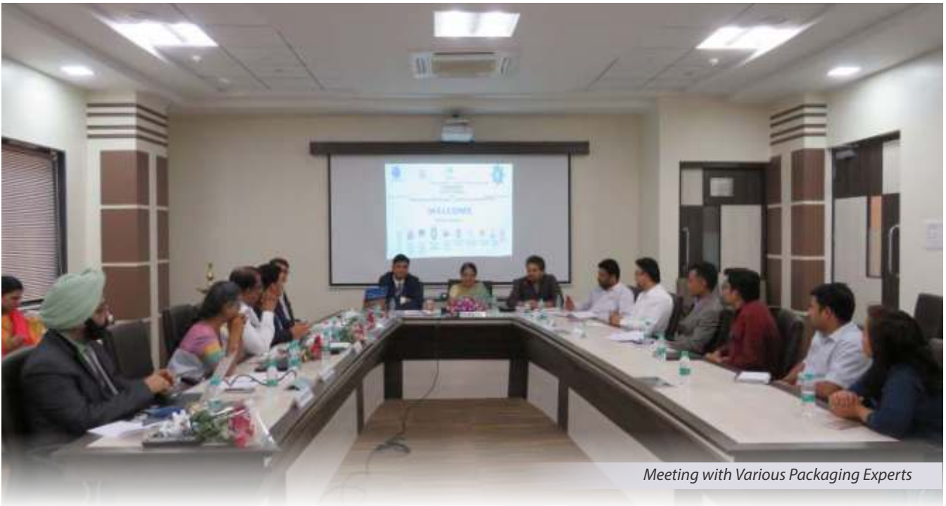
Meeting with Various Packaging Experts