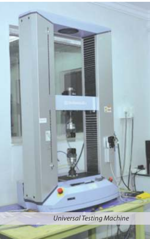
Universal Testing Machine