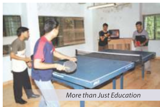
More than Just Education