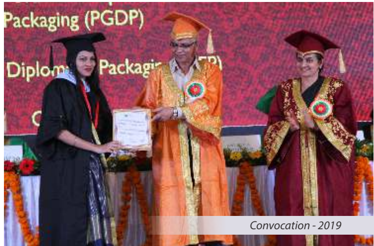
Convocation - 2019