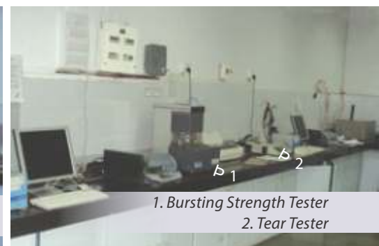
1. Bursting Strength Tester 2. Tear Tester